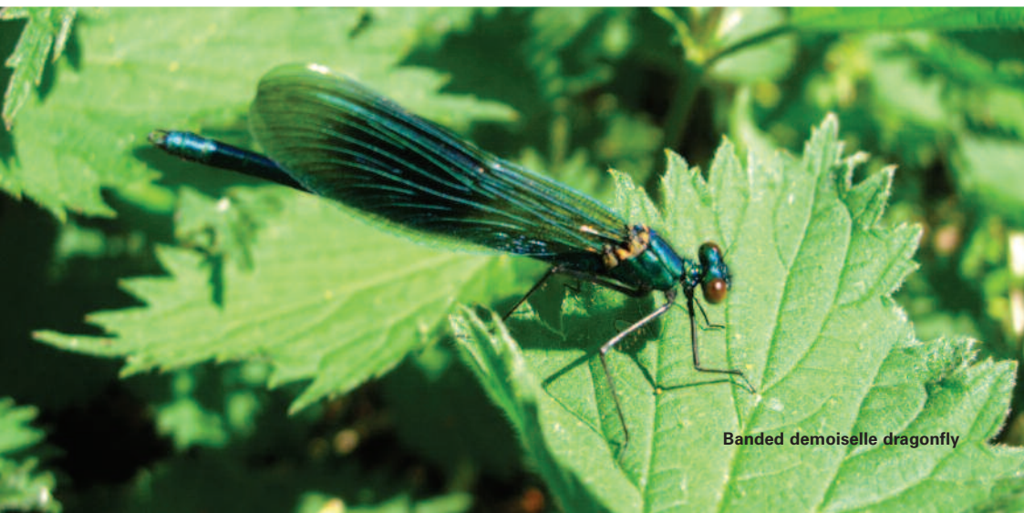
Banded demoiselle dragonfly