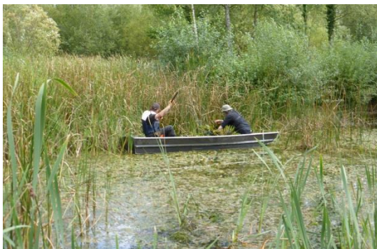
Hand removal of Water Soldier

be reviewed to ascertain if there has been an impact on the distribution of the water soldier in that area.