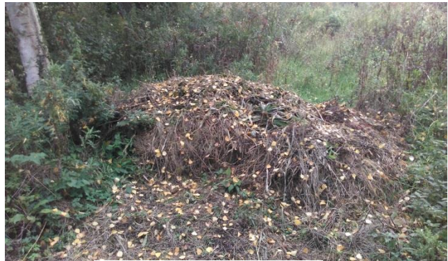
Water Soldier deposition pile.

In areas where this species is absent or in low numbers, the plant diversity continues to be much higher, strengthening the theory that water soldier smothers out other vegetation. Early indications from the macro-invertebrate surveys indicate that the abundance of many groups is lower in areas dominated by Water Soldier. The impact on Mayflies is the most dramatic, and it is thought that the increase in aquatic macrophyte in areas cleared of Water Soldier has a corresponding increase in mayfly numbers and this may be linked to an increase in other plant diversity.