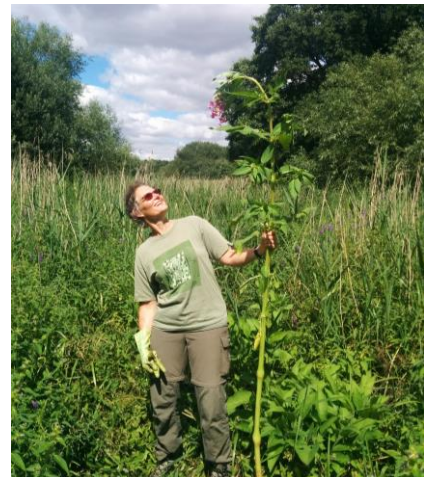
Balsam Warden holding Large Balsam Plant

Funding was secured from the Environment Agency in June 2017 to assist with the removal of Himalayan balsam along the River Flit. This allowed for us to buy in the services of contractors and extra volunteer groups. The contractors were principally used to cover the sparser areas of balsam along approximately 5.5km of the river Flit and tributary through private farmland upstream of Flitwick Moor as well as a couple of small patches of adjacent woodland including Moors Plantation CWS. Wildlife Trust volunteers, including specific Balsam wardens, focused their efforts around Flitwick Moor, Flitwick Manor Park CWS and Kingshoe Wood CWS. Other bought in volunteer groups worked on the River Flit, Running Waters tributary and ditches around Flitton Moor, covering approximately 5.7km and expanding the project area slightly downstream along the river through more farmland as far as Pennyfather's Moors.