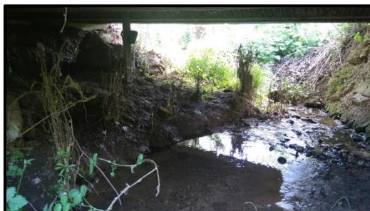
Camera under a bridge at Flitton Moor

The remote trap sensors have been very useful. They send a message to a trap checker and one of the project co-ordinators when the trap is triggered. This means that rafts with traps in no longer need to be checked daily and can be quickly checked once they are triggered. This is much more efficient and reduces the time any animal could be in the trap for. The first remote sensor was used almost as soon as it was received on a raft close to the Potton Brook. The trap was triggered at 2:59am, checked by the landowners at 6.15am and the mink it had caught was dispatched at 8.30am. A second mink was caught at the same location a few weeks later following a report of a sighting from a member of the public. Two more have been deployed in other locations but have not yet captured mink (despite in one case a mink investigating the trap as shown by a trail camera).